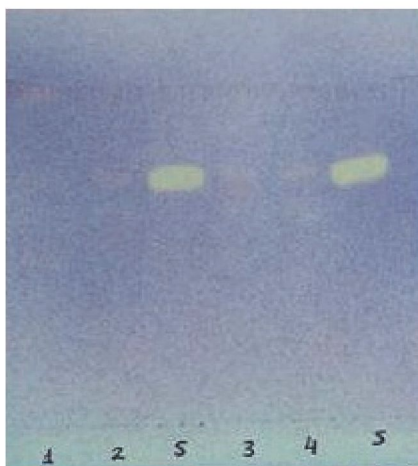
Figure 1. TLC screening of DPPH test

In the DPPH test, yellow zones on a purple background were seen with standard oleuropein and with the extracts of branches and leaves of both natural ( O. europaea var. sylvestris ) and cultivated ( O. europaea var. europaea ) olive tree. The results of the DPPH • test demonstrate that both the leaves and the branches of O. europaea varieties have faintly free radical scavenging activity. However, the yellow zones were seen more prominent in O. europaea var. sylvestris than the other variety. The highest inhibition zones were seen in the standart oleuropein (Fig. 1).